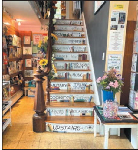
The Edgartown bookstore was so inviting you wanted to explore its shelves for a long time.

Jaws was shown in the Vineyard, as it's the 50th anniversary of the movie. The bus line even