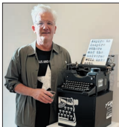
WRDSMTH with one of his inspiring creations.

Today, the new studio pulses with creativity. The ceilings soar,